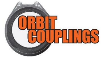
Spigot Socket sealing clamp